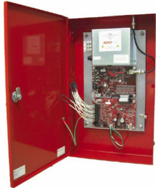
STAR Software Defined Radio Transmitter