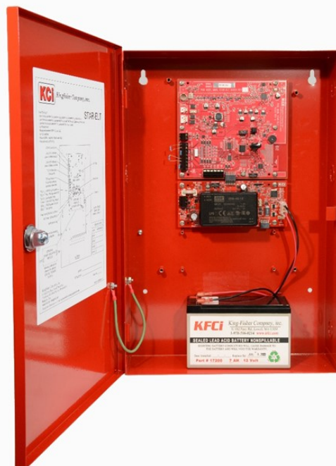
STAR-ELT Software Defined Radio Transmitter