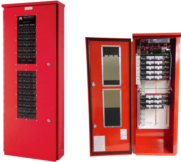
Large Enclosure (Outdoor Enclosure Shown) (Made in the U.S.A.)