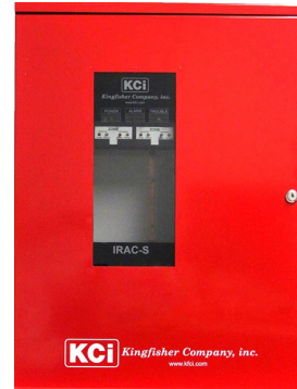
Small Enclosure (Outdoor Enclosure Shown) (Made in the U.S.A.)