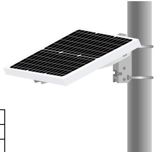
KCi #91180 Solar Cell Kit, 20W With Mounting Bracket