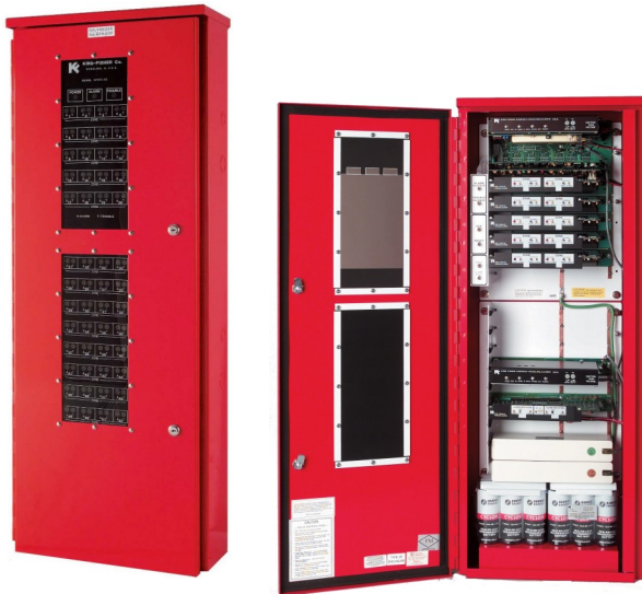
KFRTI-52 (Outdoor Enclosure Shown) (Made in the U.S.A.)