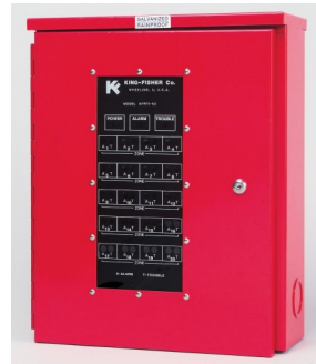
KFRTI-20 (Outdoor Enclosure Shown) (Made in the U.S.A.)