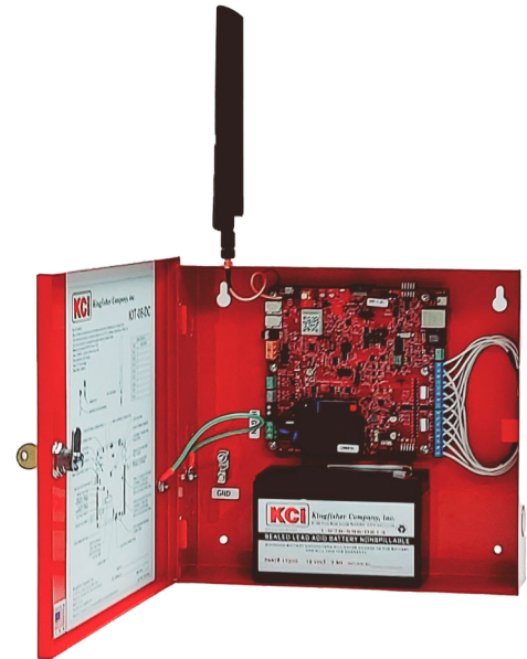
iOT-08-DC IP Emergency Event Communicator 99332