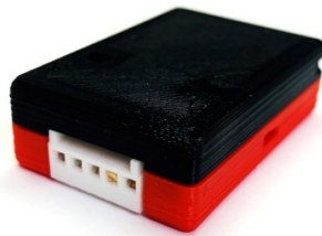
KCi Kingfisher Cordless interface module

Kingfisher Company, inc., products must be used within their published specifications and must be PROPERLY specified, applied, installed, operated, maintained and operationally tested in accordance with their installation instructions at the time of installation and at least twice a year or more often and in accordance with local, state and federal codes, regulations and laws. Specification, application, installation, operation, maintenance and testing must be performed by qualified personnel for proper operation in accordance with all of the latest National Fire Protection Association (NFPA), Underwriters' Laboratories (UL), National Electrical Code (NEC), Occupational Safety and Health Administration (OSHA), local, state, county, province, district, federal and other applicable building and fire standards, guidelines, regulations, laws and codes including, but not limited to, all appendices and amendments and the requirements of the local authority having jurisdiction (AHJ).