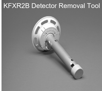
KFXR2B Detector Removal Tool